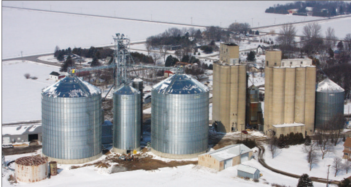
Five Star Coop's Burchinal location added two new 550,000-bushel steel tanks, a 110,000-bushel wet bin, 4,700 bph grain dryer, and a receiving pit in 2012.

Aeration fans ..... Sukup Mfg. Co. Bin sweeps ..... Springland Mfg. Bucket elevators .... Sukup Mfg. Co. Catwalks ..... Tri-co Fabrication LLC Contractor ... Buresh Building Systems Inc. Control system ..... Hope Electric Conveyors ..... Sukup Mfg. Co. Distributor ..... Schlager Inc. Elevator buckets ..... Maxi-Lift Inc. Engineering ..... C&C Engineering Grain dryer ..... Sukup Mfg. Co. Grain temperature system .... TSGC Inc. Leg belting ..... Fenner Dunlop Level indicators ..... BinMaster Level Controls Millwright ... Buresh Building Systems Inc. Motors ..... Leeson, Toshiba International Speed reducers ..... Dodge Steel storage ..... Sukup Mfg. Co. Surge tank ..... Meridian Mfg. Truck scale ..... Cardinal Scale Mfg. Tower support system ..... Tri-co Fabrication LLC