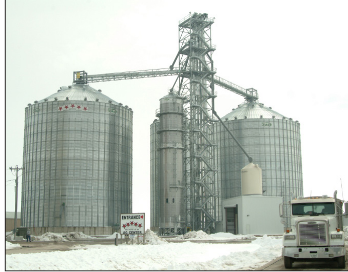
Ground-level view of Five Stars new 1.2-million-bushel steel annex.

Cardinal 70-foot pit-type truck scale. Samples are taken by a JaHam automatic truck probe and tested by a DICKEY-john moisture meter/grain analyzer.