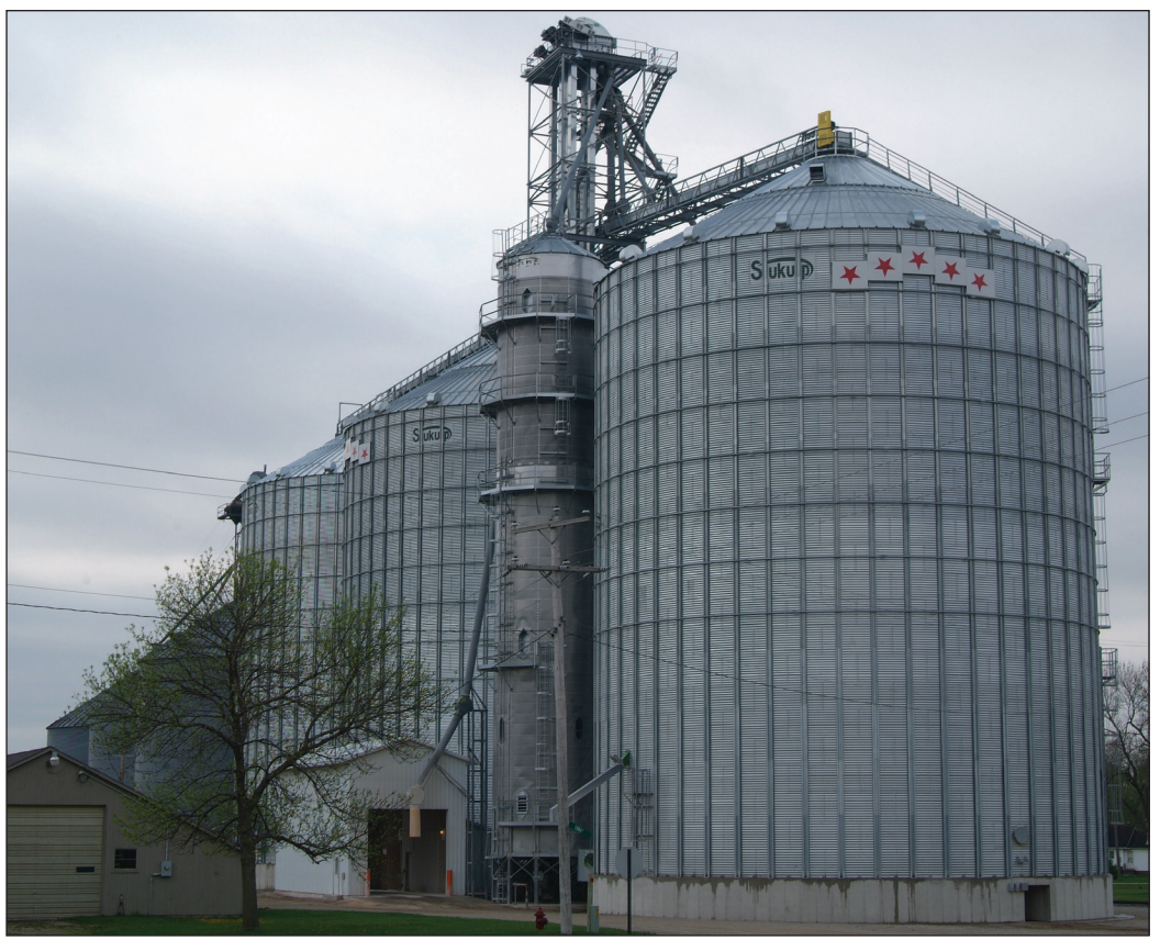
Five Star Cooperative's new steel annex in Hanlontown, IA includes more than 1 million bushels worth of steel storage plus drying capacity at 4,700 bph.

As farmers around north central Iowa, near the Minnesota state line, scurried to get the 2009 crop planted, the board of directors at Five Star Cooperative faced a serious question about their tiny steel elevator in Hanlontown (641-896-2610). Should the in-town facility remain a seasonal elevator open for harvest only, or should it expand to become a full-time elevator capable of long-term storage to take advantage of basis and spread movements?